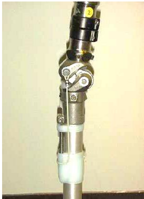
Otto Bock Weight Activated Stance Control Knee 3R49

The weight activated stance control knee is one of the most widely used knees in prosthetics. This knee is a single axis constant friction knee with a braking mechanism. When weight is put on the knee during gait, a braking mechanism is applied and the knee will not buckle. Using this knee, the patient must unload or take weight off of the prosthesis in order for the knee to bend. The wearer will need to unload the knee to sit or to initiate the swing phase of gait. This knee is sometimes referred to as the “safety” knee.