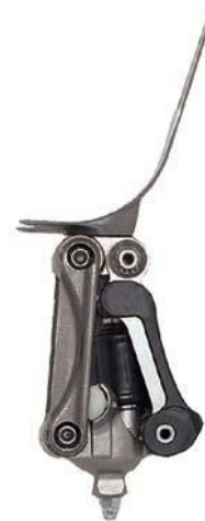
Otto Bock 3R46