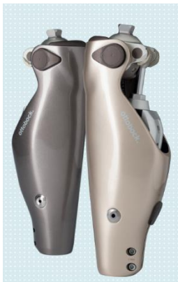
Otto Bock C-Leg

The following knees are just a few of the various computerized knees that are now available.