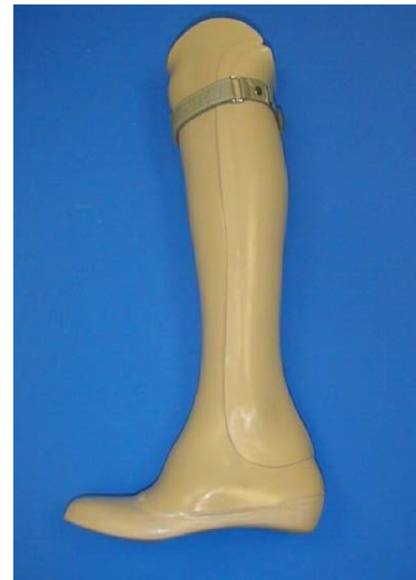
Figure 4 – Chopart prosthesis

Arlington Heights 617 E. Golf Road, Suite 108 Arlington Heights, IL 60005 847-437-3929