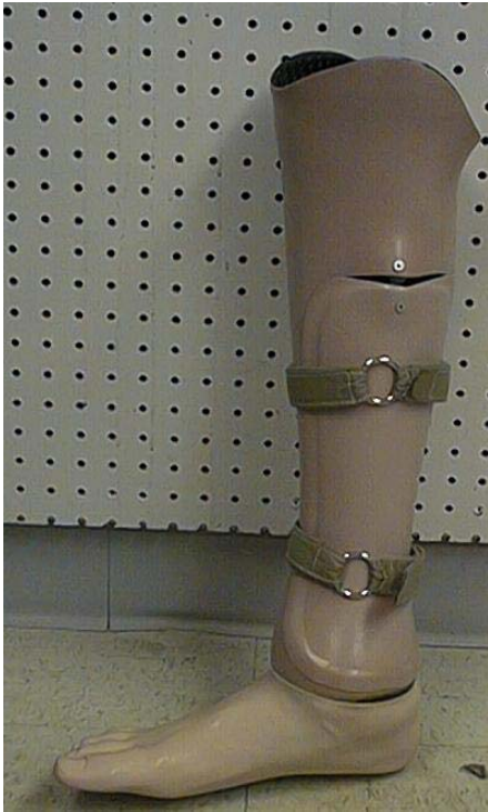
Figure 5 – Symes prosthesis