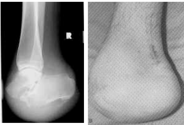
Figure 1 Chopart Amputation

A Chopart amputation is a forefoot/midfoot level amputation (See figure 1). A Syme's amputation is an ankle disarticulation or basically through the ankle amputation (See figure 2). Both types of amputations allow weight bearing on the remaining part of the foot, which means that the person can put weight on the bottom of the foot and is able to walk short distances, stand in the shower, etc. without the assistance of a prosthesis. For this reason alone, this type of amputation is advantageous. The disadvantages are that it is more difficult to produce a prosthesis that is cosmetically appealing and there are less available options for a prosthetic foot.