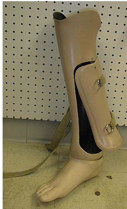
Figure 6 – Symes prosthesis