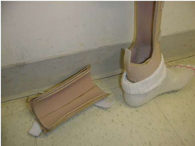
Figure 3 – Chopart prosthesis with door open