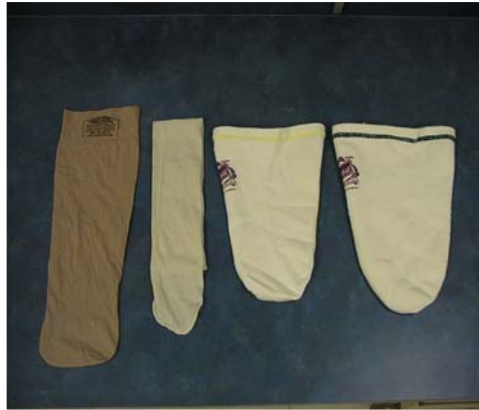
From left to right: sheath, 1-ply sock, 3-ply sock, 5-ply sock

Wear clean socks and sheaths every day. On hot and humid days many people will put on fresh socks half way through the day. Do not wear socks for several days before washing them. It is not good for your skin or the prosthetic socks. Follow the washing instructions provided by the manufacture.