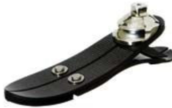
Low Profile Vari-Flex