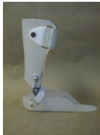
Plastic AFO with Articulated Ankle